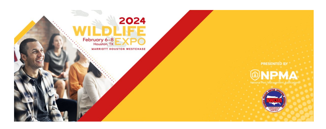
Registration is Open for the 2024 Wildlife Expo

Come and be a part of the 2024 Wildlife Expo, brought to you by the National Pest Management Associatio (NPMA) and the National Wildlife Control Operators Association (NWCOA). This event offers an enriching experience tailored to professionals engaged in wildlife management or those contemplating adding this valuable service to their portfolio.